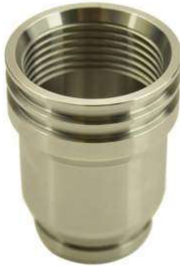
Sleeve pictured above without o-rings